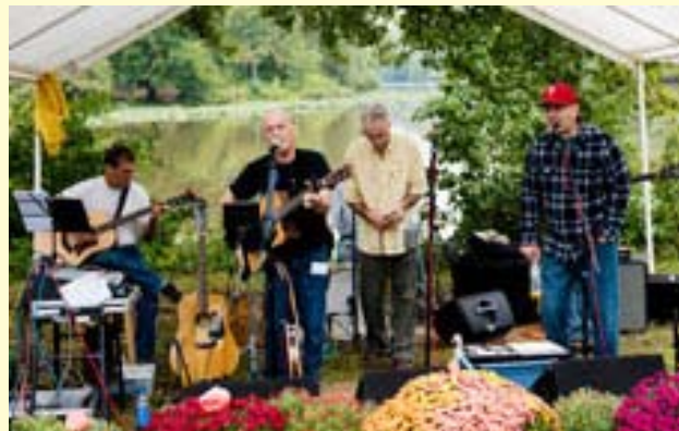
Smiling faces added sunshine to a mostly cloudy day that did not dampen the spirits of attendees. Images above: on left, Moorestown Garden Club provided lots of color; on right, Collins Flynn Band was the afternoon entertainment.