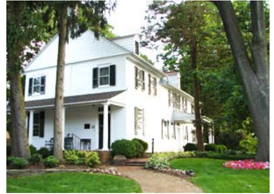
is of the Smith-Cadbury Mansion on High Street in Moorestown, headquarters of the Moorestown Historical Society.