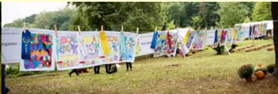
Photos above: on left canoeing on Strawbridge Lake. Thanks to Clark's Canoe Rental for handling the water sports. On right: STEM's Coloring Contest entrants on display. Photos below: on left, Girl Scout Troop 22169 booth; and on right, two fishing contest participants trying their luck at the dammed area of Strawbridge Lake.