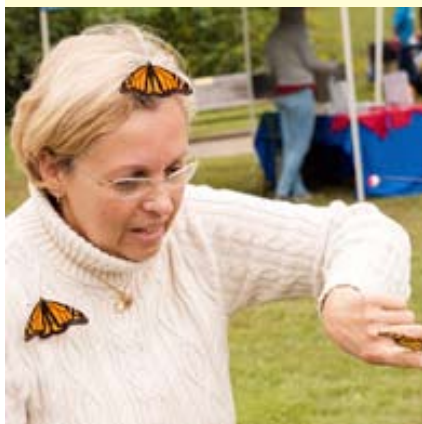
Pollinators were the stars of the show; we learned much about them from Busy Bee Farm & Pollination Station.