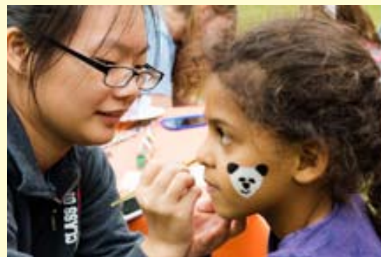
Photos above, left to right: friendly Monarchs; family canoeing fun; and face painting patience. STEM event activities are always engaging and educational for all ages.