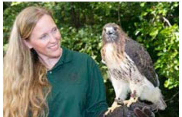
Photo below from SSO 2014, of a Cedar Run Wildlife staff person holding a rehabilitating raptor.

Any questions, comments, or suggestions, please send an email to environmentalclub.mhs.08057@gmail.com .