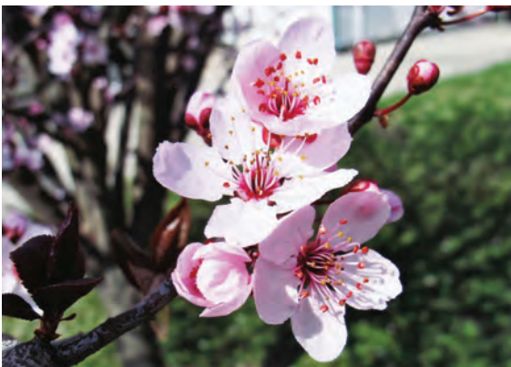
Photo on left: 2012 contest winner, 1st Place Children’s Division, “First Blossom” by Emily McClain.

All photos must have been taken in Moorestown after June 2012. Choose natural subjects such as plants, animals, and/or landscapes. Submit 5x7 inch prints (color or black and white).