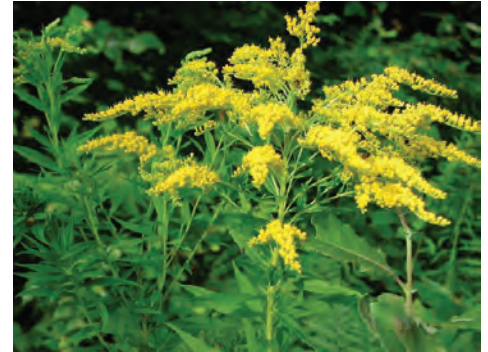
Solidago rugosa (rough-stemmed goldenrod)