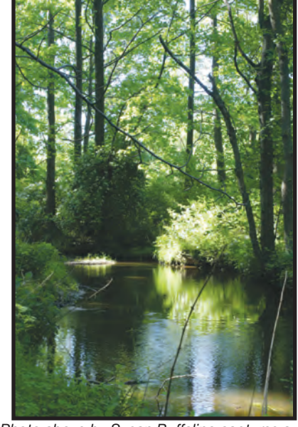
Photo above by Susan Buffalino captures a serene reflection in Swede Run of vegetation at the Esther Yanai Preserve on Garwood Road.

Debbie Lord will direct the day's work project as volunteers work together to remove some of the invasive plants that are competing with the natural vegetation of the park. This is the portion of Pompeston Park between New Albany Road and Fernwood Drive. Watch for up-to-date information on which area we will be working on and where to park. Contact Debbie Lord at <a href="mailto:dglord@aol.com">dglord@aol.com</a>.