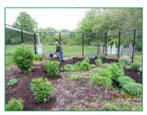
Photo on the left, taken in 2012, is of the Wigmore Acres Butterfly Garden when it was first installed.

Tuesday, May 17, 9:30-11:30 am, Little Woods, Creek Road@Laurel Creek Blvd. Just down the road from Boundary Creek Natural Resource Area, this open space has an entrance across from Susan Stevens Halbe Preserve. Its upland loop trail meanders through a variety of forested habitats and offers great views of Rancocas Creek. Park along Creek Road near the NAC signage.