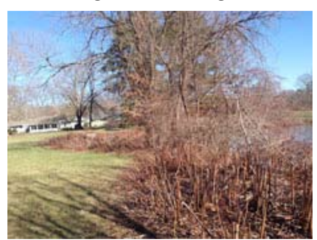
Photo above shows an area along the shore of Strawbridge Lake where Japanese knotweed was incorrectly managed.

The team working on the Strawbridge Lake long-range management plan is still gathering information and gaining knowledge, but they face challenges. The Upper Lake in particular has begun to fill again. This has also resulted in that area's being almost completely covered with spatterdock (an aquatic invasive plant) growth. Removal of the spatterdock last year required that they be dug up from the lake bed—the spreading and entangled 4" to 5" diameter roots makes this a slow and difficult process and may take several years to complete.