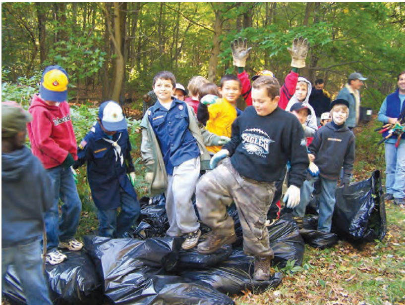
Photo above, energetic young scouts assist with a clean-up in Pompeston Park.