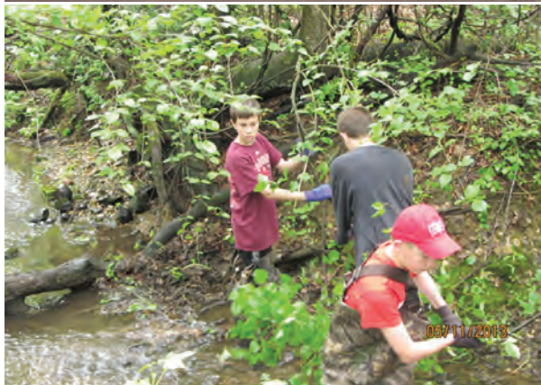
Young STEM volunteers tackle the vegetation at Wigmore Acres on May 11, 2013 during a NAC session.