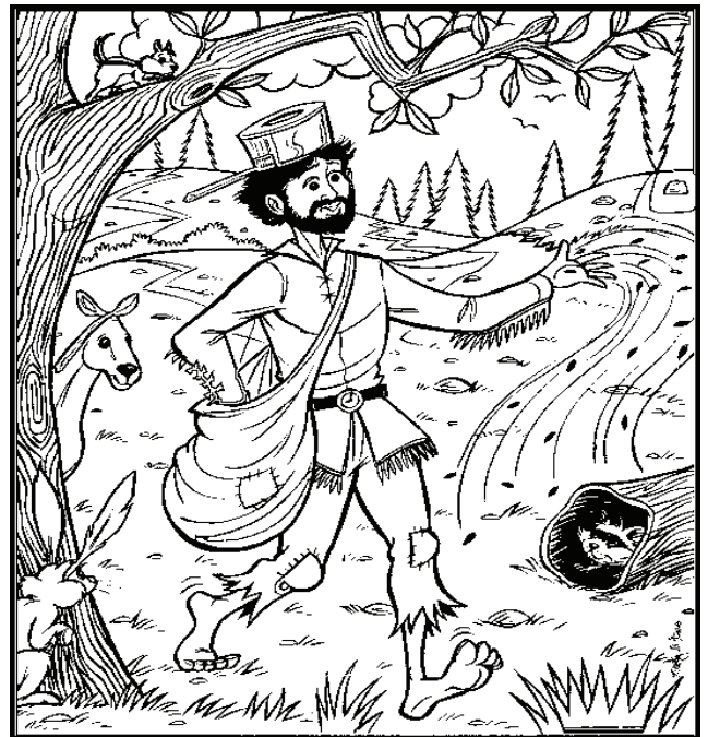
The illustration above captures the legend of Johnny Appleseed (John Chapman, 1774-1845). It was used for the STEM Coloring Contest for Moorestown students grades K-3.